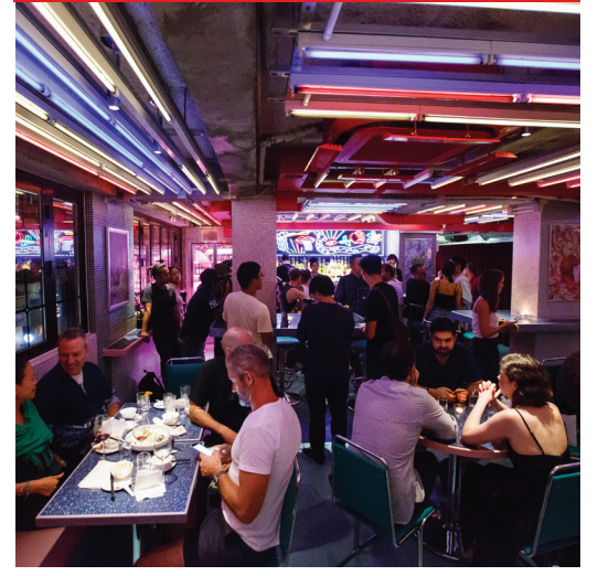
KINDLY SPONSORED BY HAPPY PARADISE

May Chow's Chinese-style "burgers" at her first restaurant, Little Bao, were a big hit, and many have been hoping for a larger restaurant for May to really spread her creative culinary wings. The answer to those prayers is Happy Paradise, a modern Chinese bistro with spectacular takes on Cantonese classics, such as slow-cooked chicken with Shaoxing wine, and braised pomelo skin with black sesame. Don't miss the cocktails either—they're all inspired by Hong Kong flavors like soy sauce, jasmine tea and hung yen cha, an almond dessert soup.