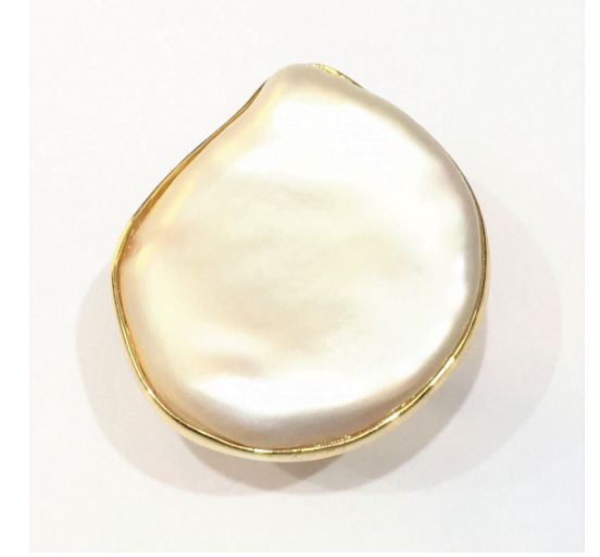
KINDLY SPONSORED BY TAYMA JEWELLERY

Check out this hip, oversized ring in gold and opalescent pearl made by Hong Kong's own Tayma Jewellery. We think it's the perfect gift for yourself or a loved one!