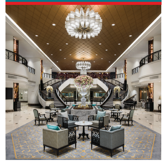
KINDLY SPONSORED BY MARRIOTT INTERNATIONAL LUXURY BRANDS

Escape for a weekend to a beautiful Athenee Room for two at this Luxury Collection Hotel in the heart of Bangkok, inclusive of breakfast and high-speed internet. The iconic 5-star hotel in Bangkok stands on the grounds of a former royal residence known as Kandhavas Palace, and is one of the most luxurious hotels in the Thai capital.