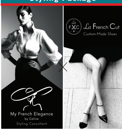
KINDLY SPONSORED BY LA FRENCH CUT X MY FRENCH ELEGANCE

Be confident in your own style with a 90 minute style consultation with My French Elegance's stylist Celine, followed by the making of your very own handmade, 100% leather and comfortable shoes from La French Cut's Custom collection.